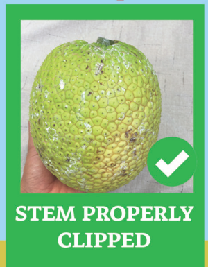
STEM PROPERLY CLIPPED