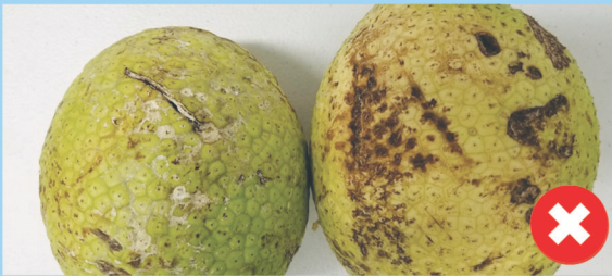
Bruised and lacerated fruit

Try to avoid letting fruit hit the ground to prevent bruising. Ensure fruit is not cut by picker blade as deep lacerations are not acceptable. Don't leave fruits in the sun! Keep them in a shaded cool area. Visibly diseased or significantly damaged fruit does not meet food safety standards and will not be accepted .