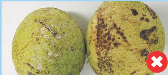
Bruised and lacerated fruit

Do not harvest fruit that has fallen onto the ground. When harvesting, avoid letting fruit hit the ground to prevent bruising. Deep lacerations are not acceptable. Ensure fruit is not cut by picker blade.