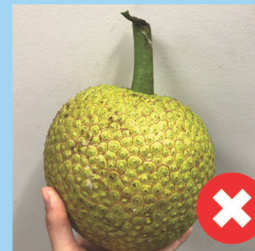
Stem not clipped